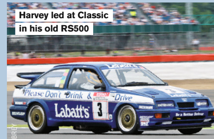
Harvey led at Classic in his old RS500

My goal would be to genuinely challenge the Super Touring cars on pace and race with them. I think they should be able to do that. I'd like to have a go in a proper Super Touring car as well.