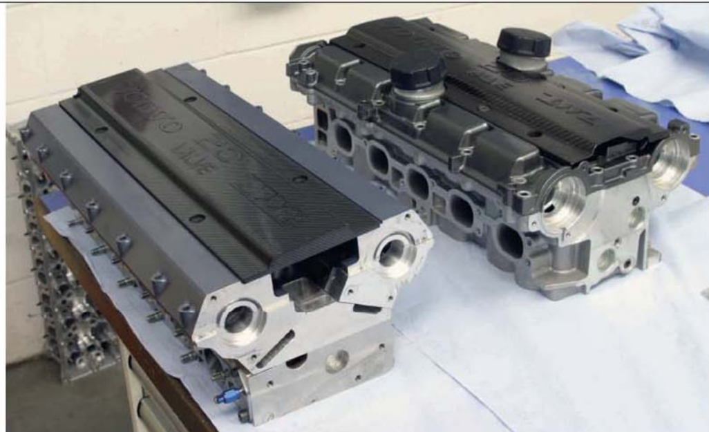
The Super Touring rules said nothing about the angle the head had to sit on the block - a loophole TWR exploited to great effect. The standard Volvo head is on the right in this photo, the fully compliant TWR version on the left

relates to the fact the Touring Car regulations of the time did not stipulate how the cylinder head was to sit on the engine block. Significantly, the measurement of the included angle for the inlet and exhaust valves related to the production head, which had a uniform height across its width. By machining the head face to a 'wedge' and cutting back the face of the port where the inlet manifold mounts, Bamber and his team were able to achieve a