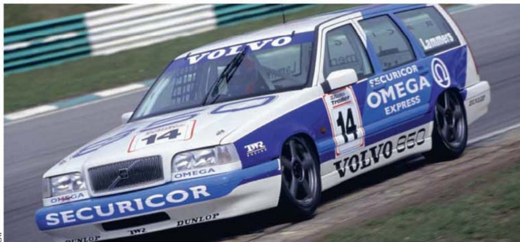
After the 850 estate Touring Cars, Volvo switched to the 850 saloons. All cars were run by Tom Walkinshaw Racing

The first area they looked at was camshafts, and it immediately became obvious that for the sort of profile required to achieve the desired performance, the limiting factor would be the inability of the standard cylinder head to accommodate cams with the necessary base circle diameter. At the same time, the more radical cam profile required tappets larger than the standard engine's 32mm offerings; 36mm was the preferred diameter, as it would allow the team to run cams with sufficient lift for the largest valves that could be fitted to the combustion chambers. A standard production camshaft, for example, would have approximately 300thou of lift, while the ultimate cam TWR was looking to run in the Volvo engine had 825thou of lift. The challenge was to make the chosen cams and tappets fit and still comply with the rulebook.