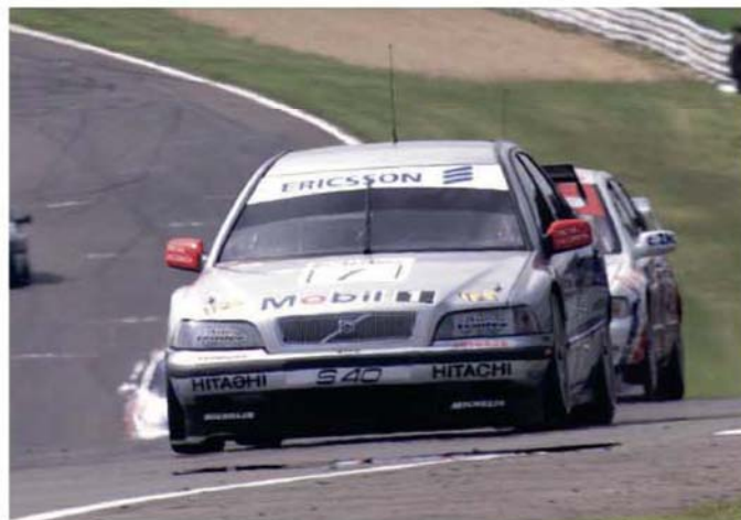
In 1998, fitted into the smaller S40 saloon, the TWR-developed engine brought Volvo the Touring Car glory it so richly deserved

to £15,000 per head to make. In short, you've produced a £15,000 version of a £200 head. The argument then has to be, "Why not just let somebody